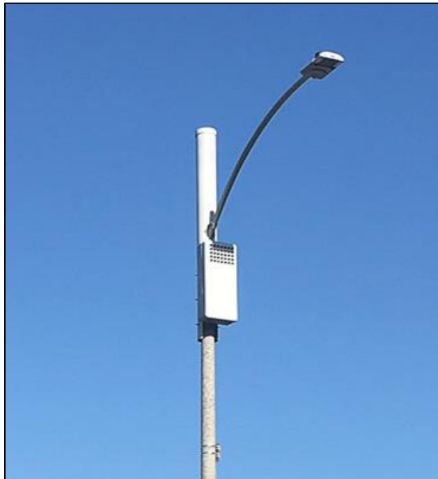
Figure 6: Flush-mounted radio shroud.