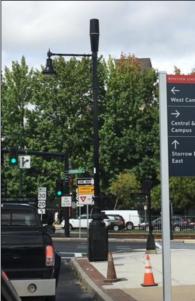
Figure 8: Base-mounted accessory equipment.