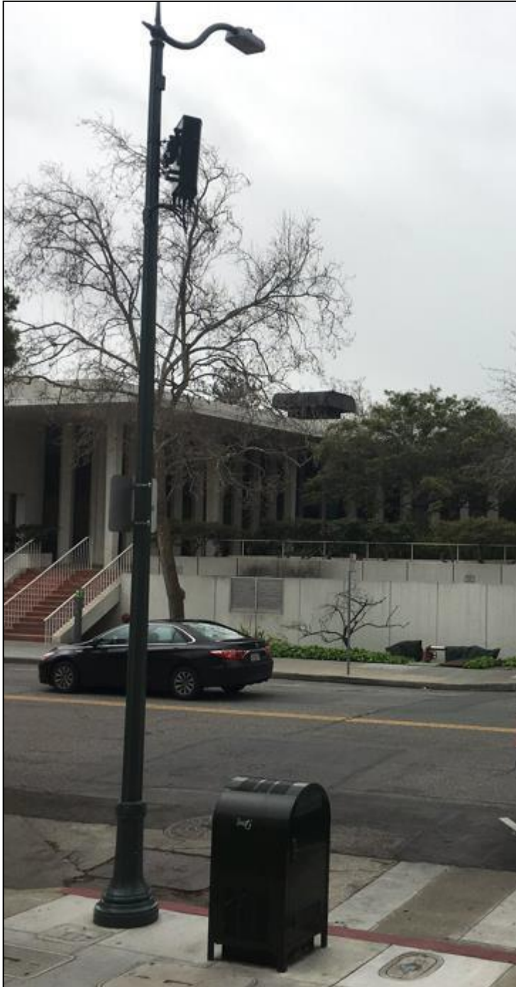
Figure 7: Ground-mounted accessory equipment concealed as a mailbox.

should be completely shrouded or placed in a cabinet substantially similar in appearance to existing ground-mounted accessory equipment cabinets.