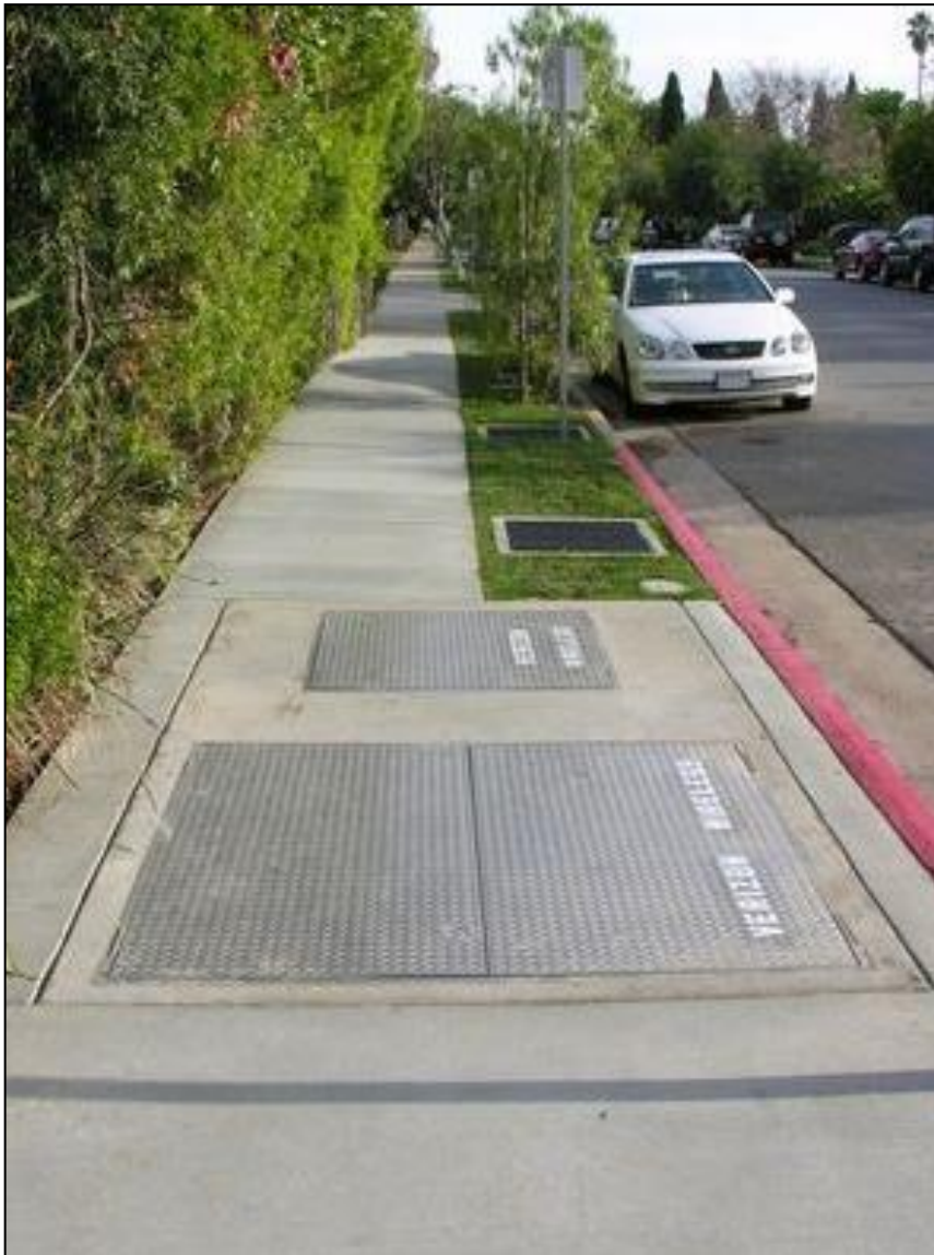
Figure 3: Flush-to-grade underground equipment vault.

(k) Pole-Mounted Accessory Equipment. The provisions in this subsection (k) are applicable to all pole-mounted accessory equipment in connection with small wireless facilities and other infrastructure deployments.