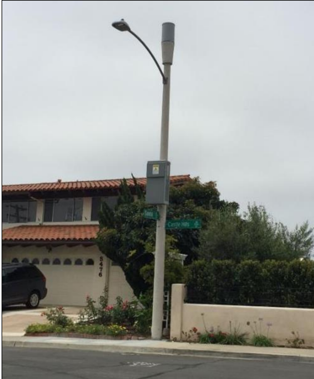
Figure 1: Antenna concealed within a single shroud (or radome) with a tapered cable shroud between the antenna and pole-top