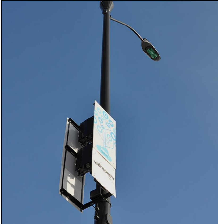
Figure 7: Accessory equipment concealed behind banners.

reduce the overall profile when viewed from the nearest abutting properties. If orientation toward the street is not feasible, then the proper orientation will most likely be away from oncoming traffic. If more than one orientation would be technically feasible, the Director may select the most appropriate orientation.