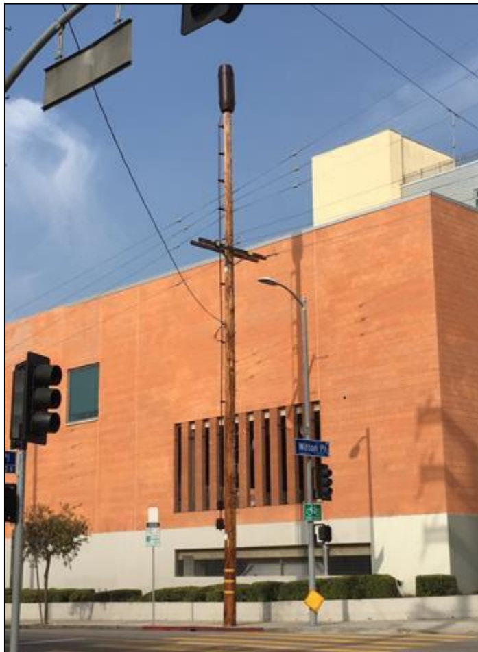
Figure 2: Pole-top antenna on a wood utility pole with tapered shroud.

(4) Horizontal Projection. Side-mounted antennas, where permitted, shall not project: (i) more than 24 inches from the support structure; (ii) over any roadway for vehicular travel; or (iii) over any abutting private property. If applicable laws require a side-mounted antenna to project more than 24 inches from the support structure, the projection shall be no greater than required for compliance with such laws.