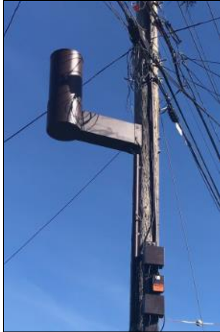
Figure 5: Shrouded, side-mounted antenna on wood utility pole to comply with CPUC horizontal separation requirements.