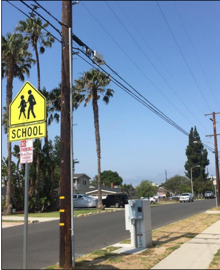
Figure 10: Strand-mounted wireless facility with a ground-mounted remote power source.